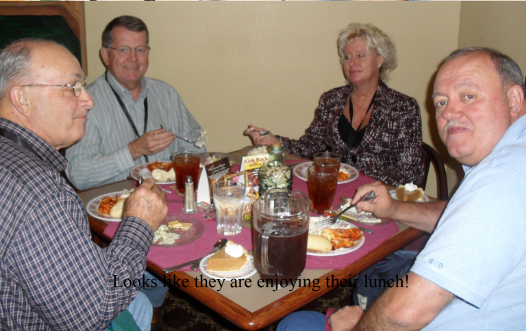
Looks like they are enjoying their lunch!