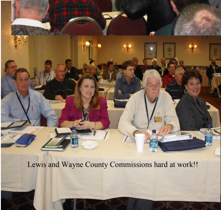
Lewis and Wayne County Commissions hard at work!!